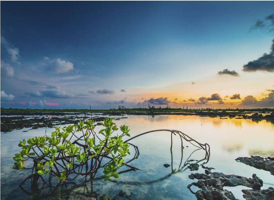
Cover: Flocks of Dunlin in flooded rice fields in Colusa, California. This page, from top: Building a storm water retention wall in Washington, DC. Eleuthera, The Bahamas