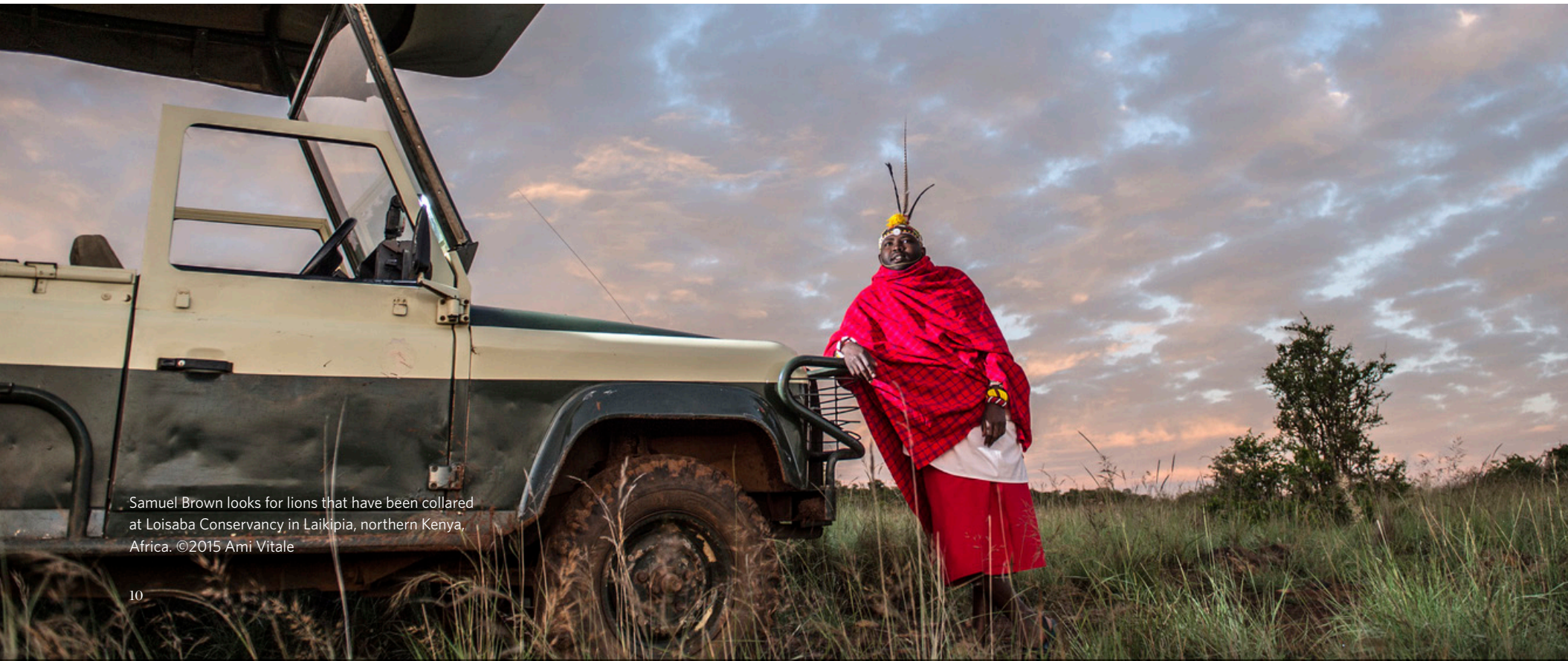
Samuel Brown looks for lions that have been collared at Loisaba Conservancy in Laikipia, northern Kenya, Africa.

and sustainable development outcomes through more durable and creative collaboration.