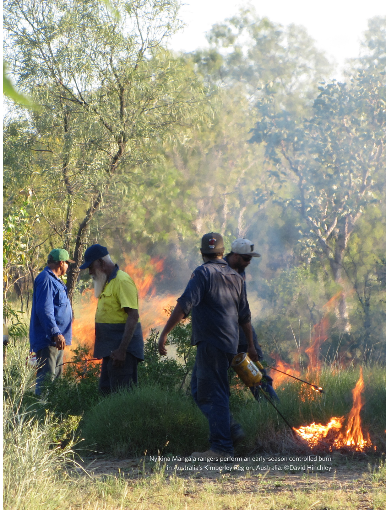
Nyikina Mangala rangers perform an early-season controlled burn in Australia's Kimberley Region, Australia.

Indigenous peoples and local communities are driving sustainable solutions for land and waters management through their engagement and partnership with governments, corporations, and other actors in planning and decision-making processes.