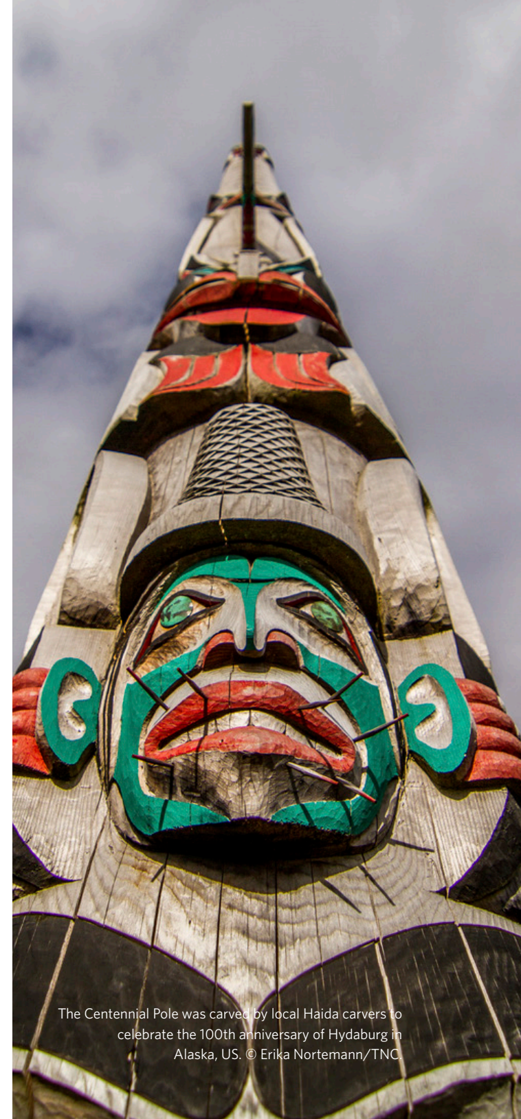
The Centennial Pole was carved by local Haida carvers to celebrate the 100th anniversary of Hydaburg in Alaska, US.

A stronger voice leads to the inclusion of indigenous knowledge and local priorities and values in plans and solutions; the ability to exercise and influence choice