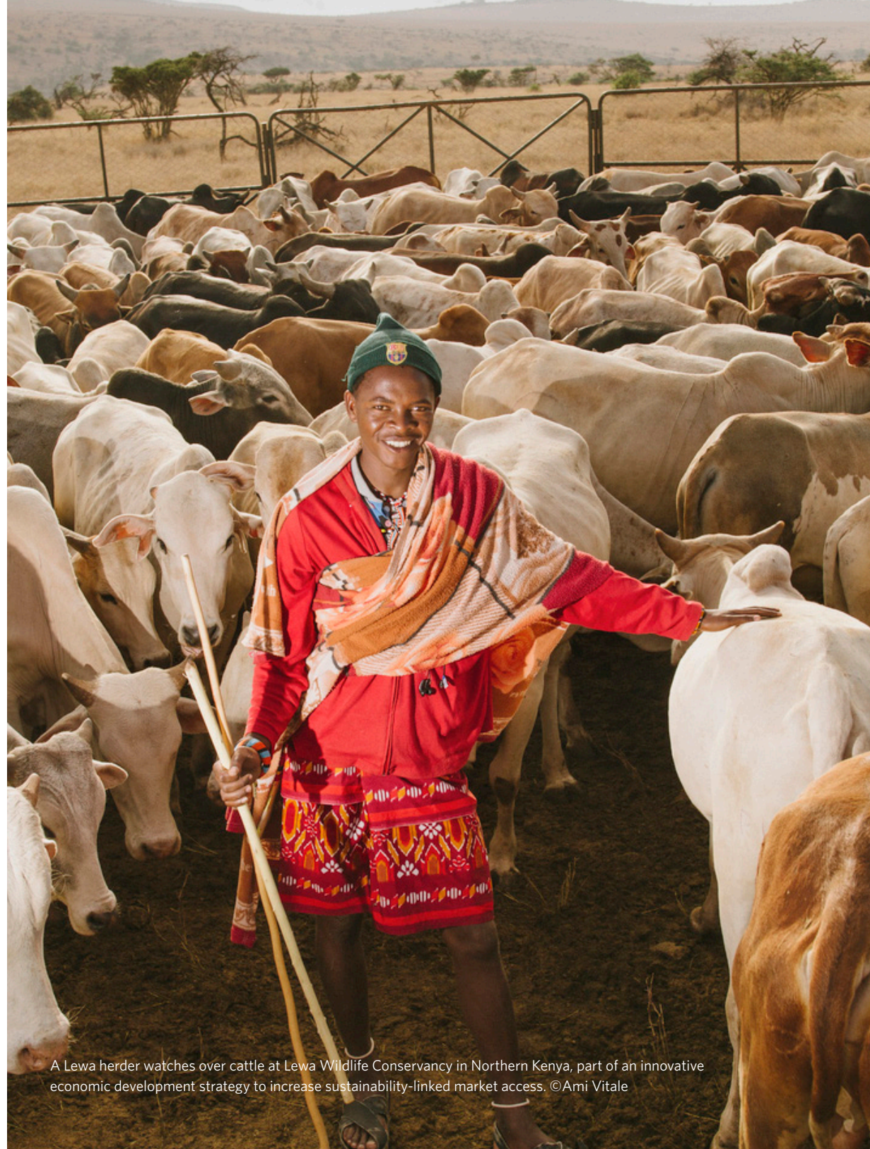
A Lewa herder watches over cattle at Lewa Wildlife Conservancy in Northern Kenya, part of an innovative economic development strategy to increase sustainability-linked market access.

These results were achieved by dozens of local and regional projects working in partnership with indigenous peoples and local communities. Building on this solid foundation, the Conservancy is implementing a Global Strategy for Conservation in Partnership with Indigenous Peoples and Local Communities that will amplify, innovate and collaborate to achieve broader, more ambitious outcomes for conservation and sustainable development.