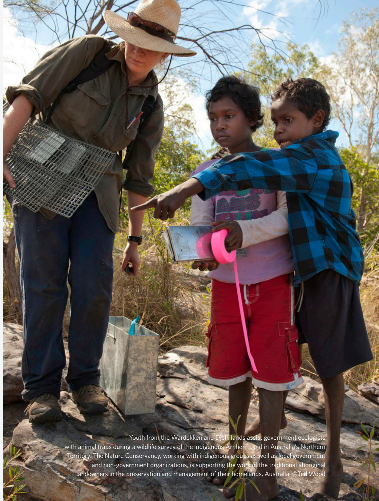
Youth from the Wardeken and Djelk lands assist government ecologists with animal traps during a wildlife survey of the indigenous Arnhem Land in Australia's Northern Territory. The Nature Conservancy, working with indigenous groups as well as local government and non-government organizations, is supporting the work of the traditional aboriginal landowners in the preservation and management of their homelands, Australia.

TNC's decades of experience partnering with indigenous peoples and local communities has demonstrated the huge potential for strengthening both conservation and local well-being by changing the distribution of power that in many